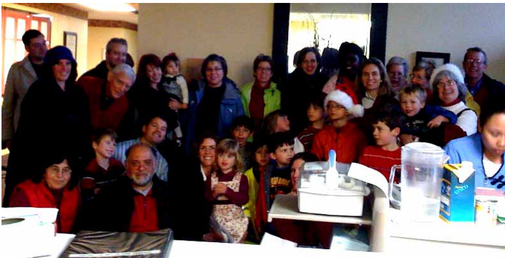
Caroling at the Fifth Avenue Health Care Center