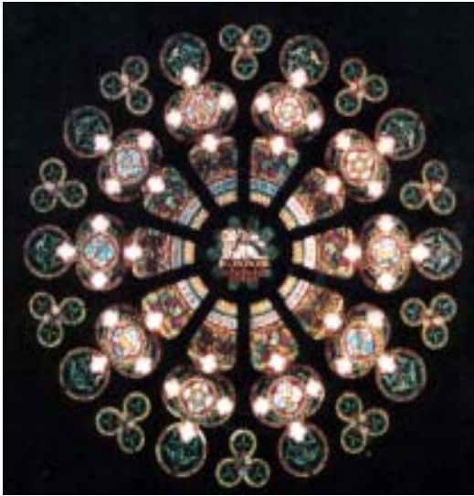
The Rose Window, 1895