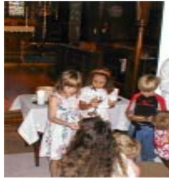
Where the Wild Things Worship A Service for Kids & Families