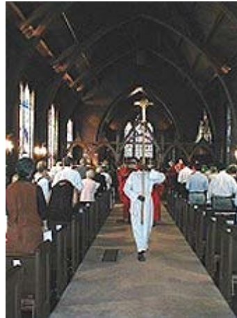
The Conclusion of the 10:30 Sunday Service