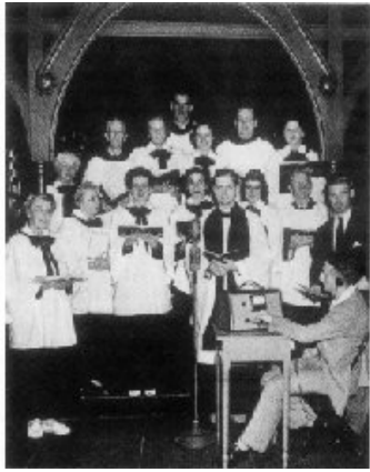
Choir on the Air, 1948

At its core, Christianity is largely about community—about people praying and