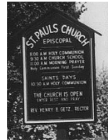
Welcoming Sign, 1958 "The Church is Open"

The mission of St. Paul's History Team is to explore the fascinating history of the church, its parishioners, and its community. It is to rediscover those voices of the past and let them be heard again with all the vigor that formed St. Paul's as it exists today. It does this by reviewing archival documents and photographs, collecting oral histories, and discussing the bonds that tie the then to the now . Call the Parish Office for information on how to join this enduring adventure.