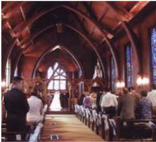
A wedding, 2000