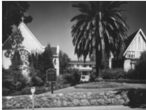
Church, Parish Hall and Rectory, 1958