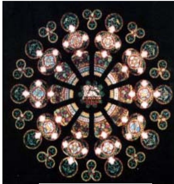
The Rose Window, 1895

church windows in the West, the Apocalyptic Rose Window of 1895.