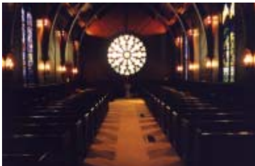
Looking toward the Rose Window, late afternoon